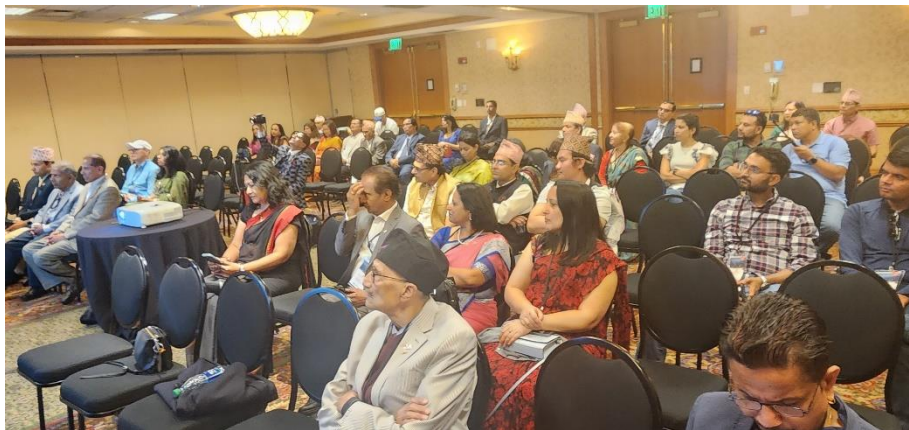
Another view of the Forum audience