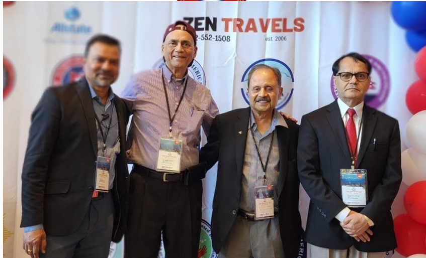
A pic taken after the Nepal Forum