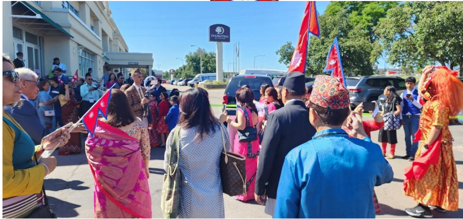
ANA Denver 2023 Convention Inauguration Parade