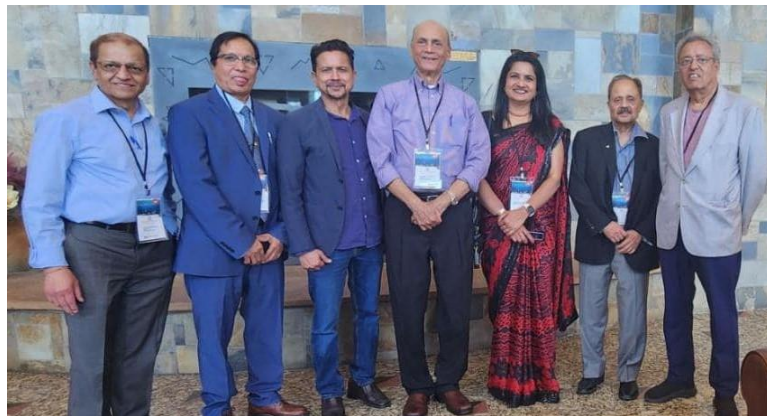
A post-Forum group pic