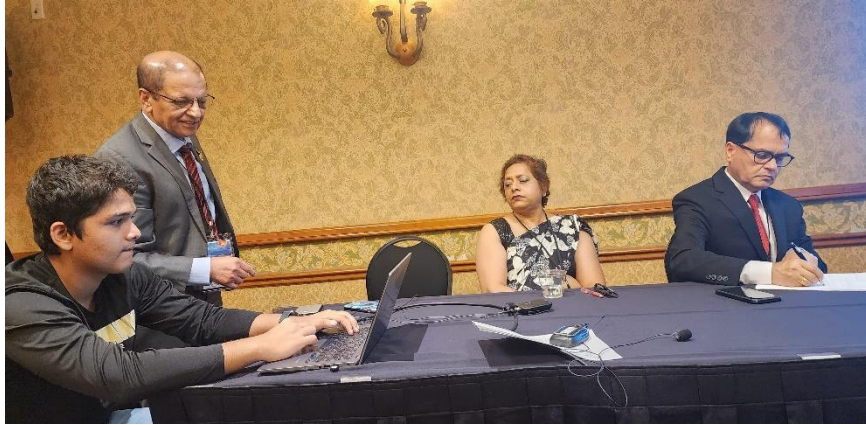
Forum Presenters, volunteer