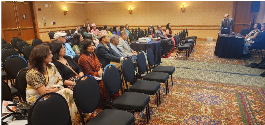
One view of the Forum audience