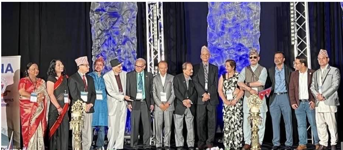
ANA Denver 2023 Convention Recognition at Inauguration