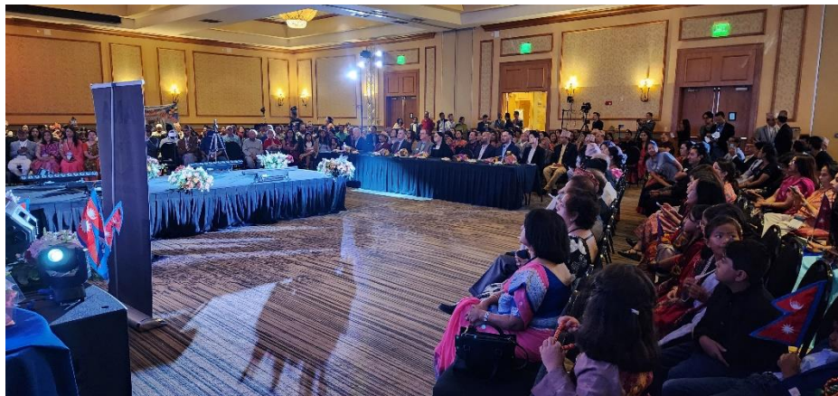
ANA Denver 2023 Convention Inauguration Session